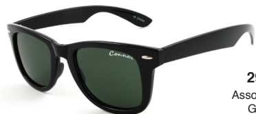
2911 Assorted Glass