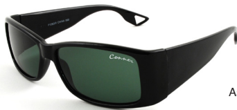
2905 Assorted Glass