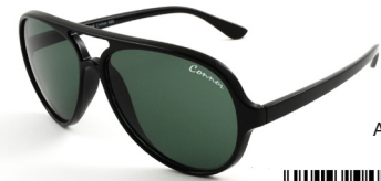
2903 Assorted Glass