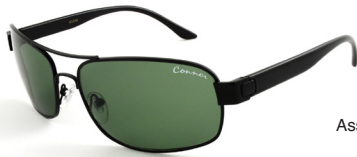
2900 Assorted Glass