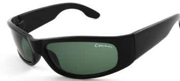
2907 Black Glass